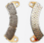
B BRAKE PADS » FRONT • 2209963 » REAR • 2209964