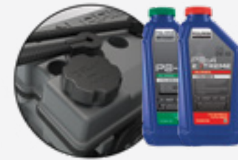
G ENGINE OIL P. 60 » PS-4 • 1 QT • 2876244 » PS-4 • 1 GAL. • 2876245 » PS-4 EXTREME • 1 QT • 2889395 » PS-4 EXTREME • 1 GAL. • 2889396

2.5 QT Engine Oil (Oil varies by kit), 1 Oil Filter (2540086) & 1 Drain Plug Washer » PS-4 • 2879323 » PS-4 EXTREME • 2890057