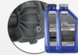
I AGL Transmission fluid » 1 QT • 2878068 » 1 GAL. • 2878069 » EXTREME • 1 QT • 2891028