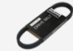
A DRIVE BELT » 3211186 » HD • 3212358