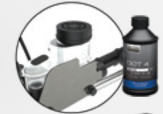
J DOT 4 BRAKE FLUID » 12 OZ • 2872189