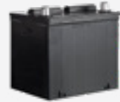
D BATTERY » 4014132-P » HD • 4081855