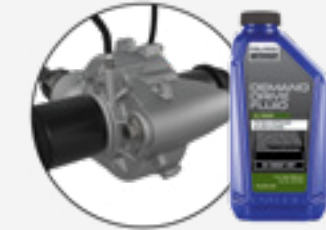
H DEMAND DRIVE FLUID Front gearcase fluid » 1 QT • 2877922 » 2.5 GAL. • 2877923