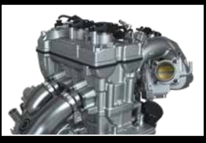
PROSTAR S4 ENGINE The all-new ProStar S4 delivers easy ownership and spirited performance in the under 100 hp class, based on the proven ProStar engine architecture.

LOCK & RIDE® PLATFORM Integrated design allows for maximum storage, with or without passenger seat. A huge 85lb. (38.5 kg.) carrying capacity and. integrated Lock & Ride mounting system holds cargo box and other storage accessories.